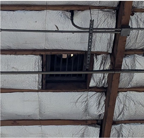
1. Current roof mounted exhaust fan - to be replaced