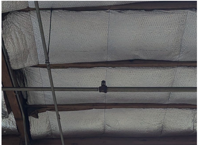
2. Fire suppression sprinkler - to be replaced